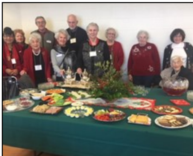
Holiday Green Tea 2017

You are cordially invited Annual Holiday Green Tea