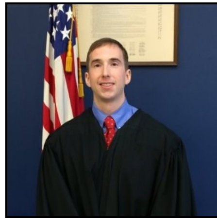
Judge Brian J. Hunt

Those attending who want to bring a sack lunch or not have lunch are asked to make a reservation to ensure adequate seating for the meeting.