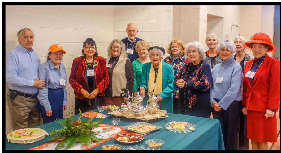
Holiday Tea 2018