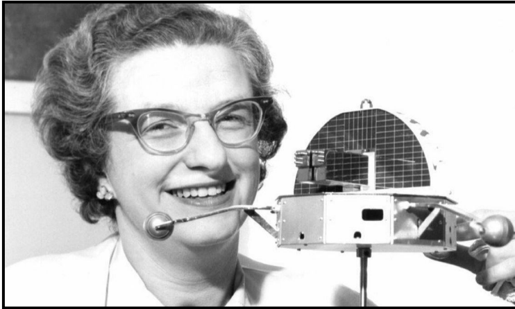
Nancy Grace Roman

Nancy Grace Roman (1925-2018) is known as "The Mother of the Hubble." Many members will remember Nancy Grace's visit here the year of the 25th anniversary of the Hubble. AAUW and Friends of the Oak Ridge National Laboratory sponsored her talk which was well attended at the Museum of Science and Energy. She was a long-time active member of AAUW.